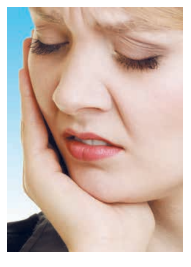
If you think you have a dental emergency situation, call us immediately!

Toothache? Swish with saltwater & apply a cold compress, then call us!